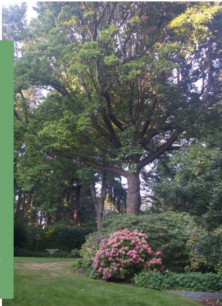
Magnolia acuminata , Champion Tree