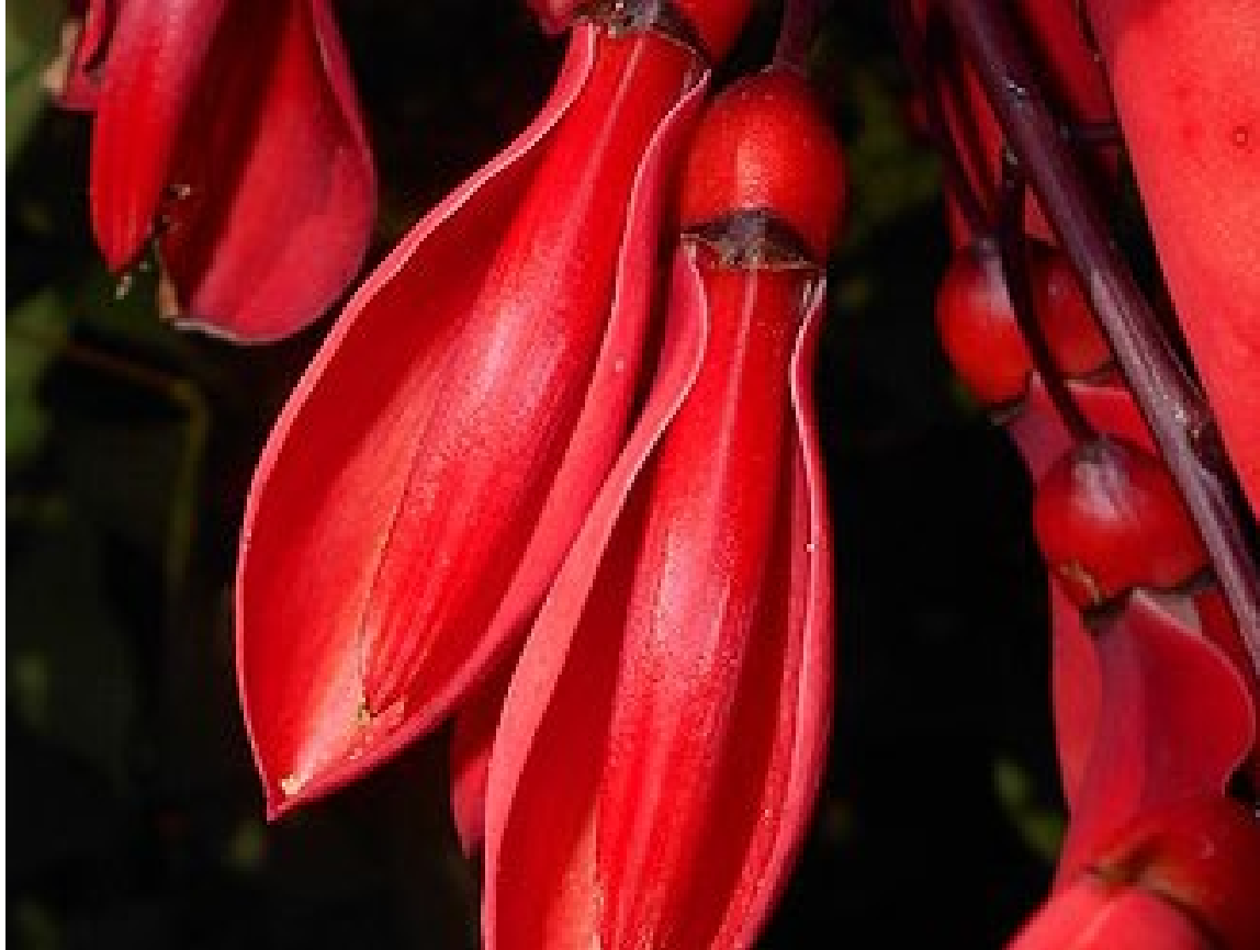
Another close-up of the flower