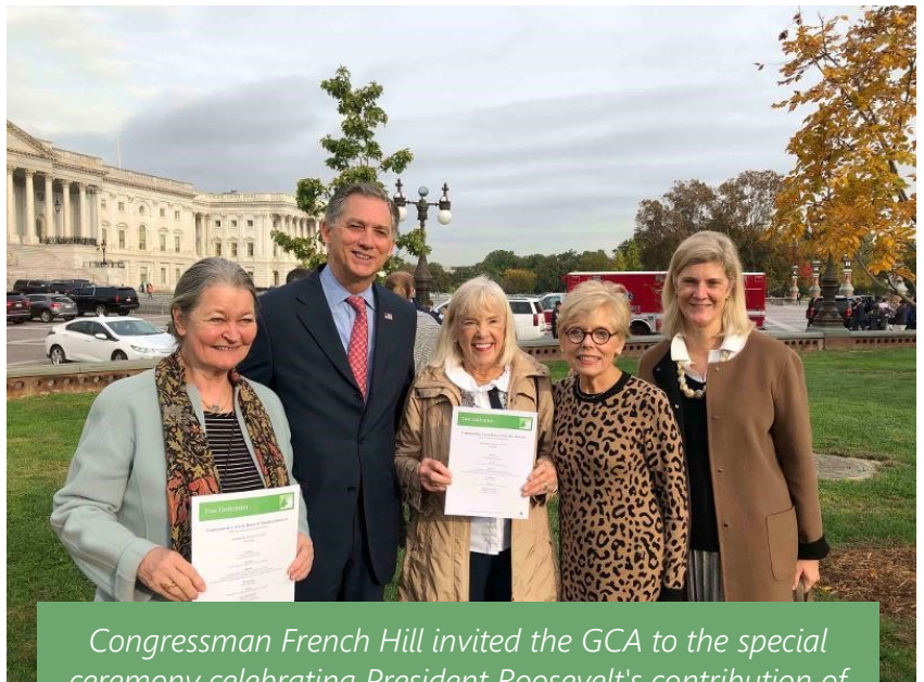
Congressman French Hill invited the GCA to the special ceremony celebrating President Roosevelt's contribution of conservation and stewardship of the United States with the planting of a white oak on the US Capital Grounds

Roosevelt was also the first president to create a Federal Bird Reserve, and he would establish 51 of these during his administration. These reserves would later become today's national wildlife refuges, managed by the United States Fish and Wildlife Service (USFWS). Today there is a national wildlife refuge in every state, and North Dakota boasts the most refuges of any state in the country. Excerpt from Roosevelt's speech in May of 1908 at the annual Conference of Governors: