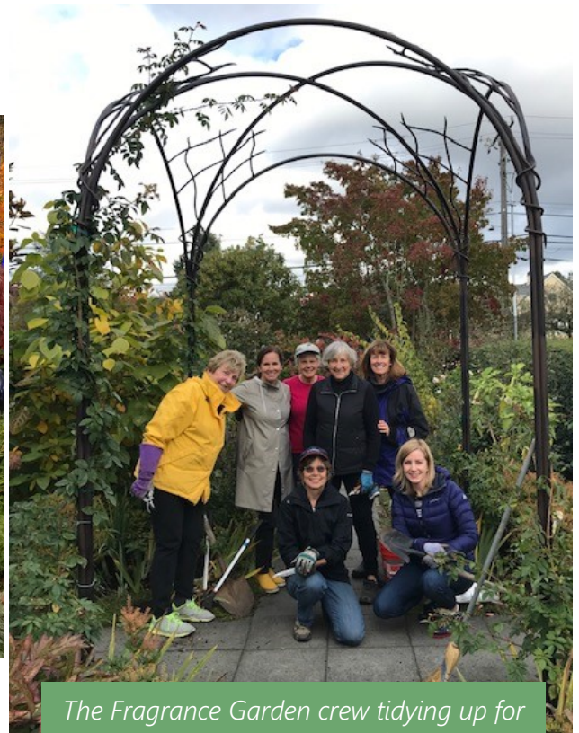
The Fragrance Garden crew tidying up for the winter. Keep an eye out for the white hyacinths in the spring!