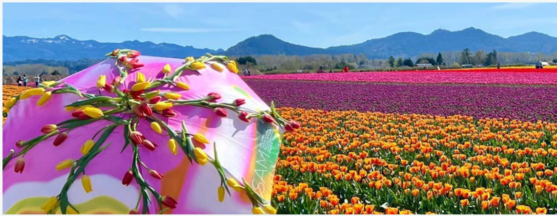
Chelsea Fringe Info Here