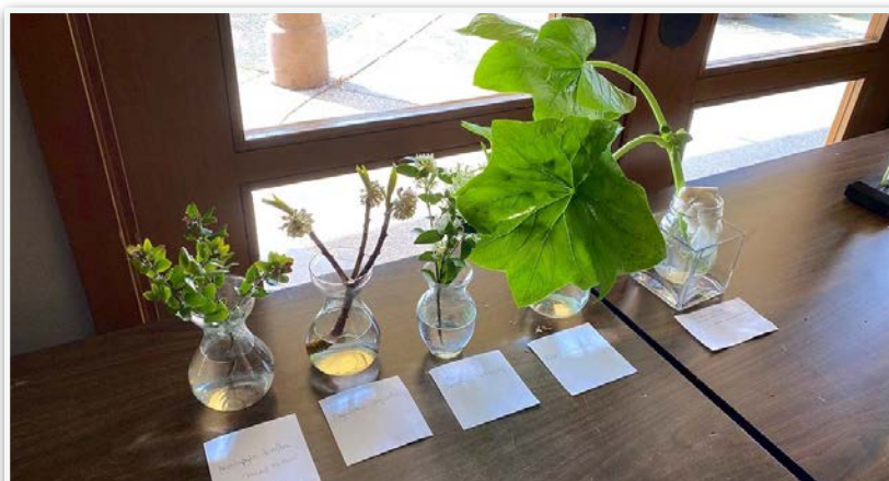
Some of our Hort Share - More photos here