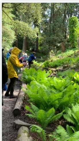
More photos here