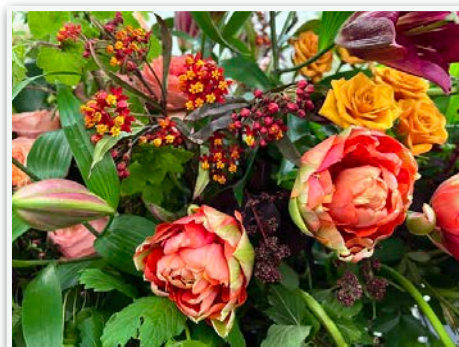
Fay Page and all attendees enjoyed photographing the wonderful flowers following the meeting More photos here