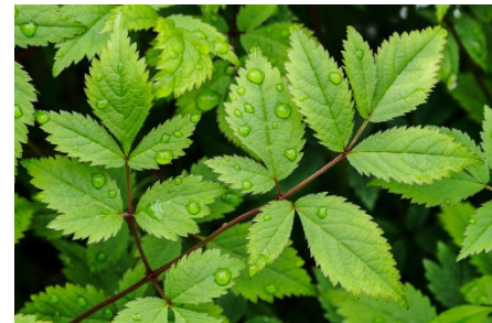
opposite leaf patterns