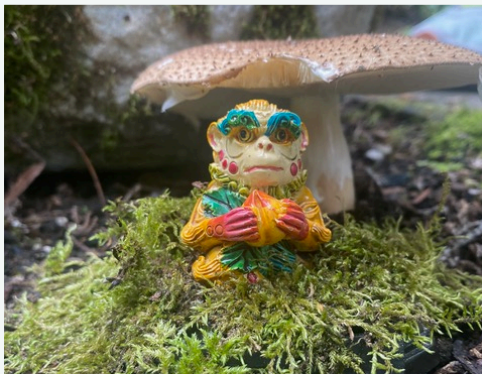
"Rain" by Charlee Reed

Show Photographer Volunteers Needed to photograph our 2024 May 7-9 th Flower Show! Please consider and review this Helpful "How To" Photograph A Flower Show and contact Kim Bishop, kimbsgcphoto@gmail.com , 206-930-5564.