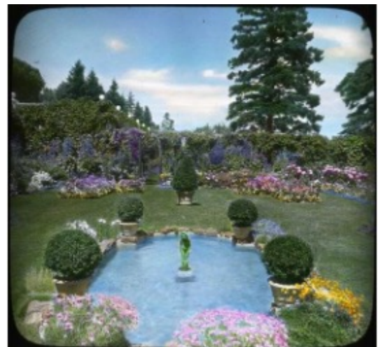
' Baymeath,' Louise DeKoven Bowen Garden, Bar Harbor, ME.

Glass lantern slides from the Garden Club of America Collection at the Archives of American Gardens.