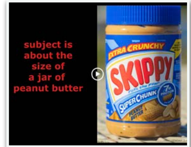
"Photographic Terms" Video Copyright by Michele Burton

Photographic Terms Video by Michele Burton: Looking at our show classes , are you wondering what is the difference between an intimate landscape and a normal one, and more? Well, here is help from Michele Burton's "Photographic Terms" (c) short video, select here Please note this is copyright material Michele Burton has explicitly shared for use only by SGC.