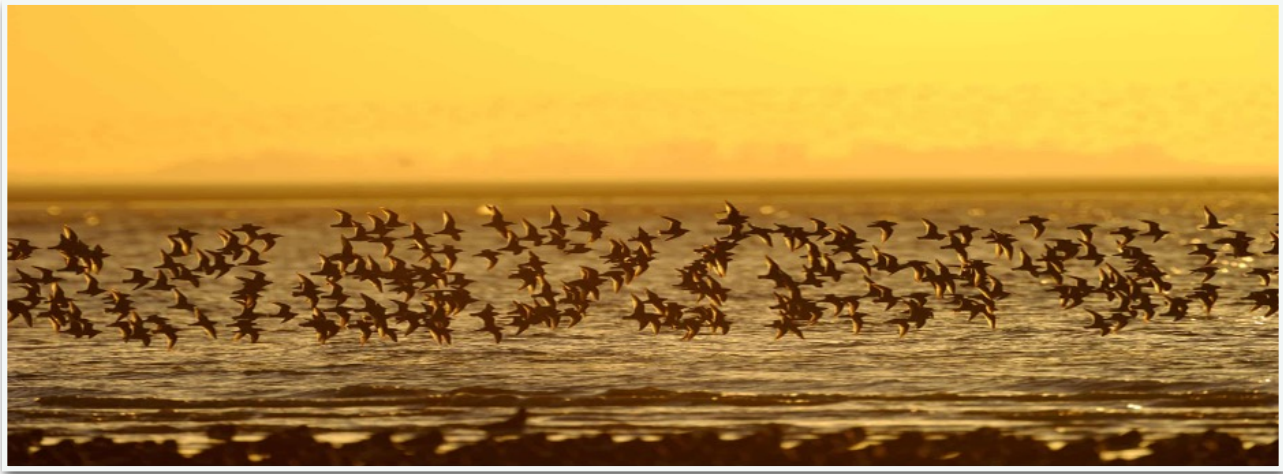
Bar-tailed Godwits arriving at a roost.